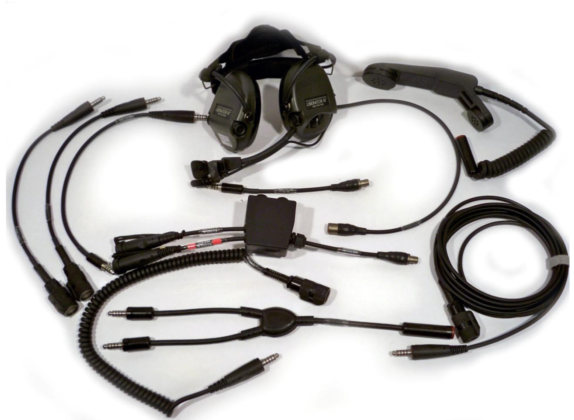
(Liberator III™ ITJCS Components Depicted Above)

The capabilities of the ITJCS™ can be expanded based upon mission requirements to include a "Dual-Comm" Throat Microphone for HALO/O 2 Mask/Bio-Chem Mask applications or other mission-specific TCI Tactical Headsets.